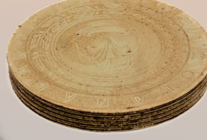
6 layers wafer cake

Wafer cake triangle with cream, glazing and sprinkling