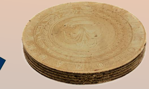
6 layers wafer cake