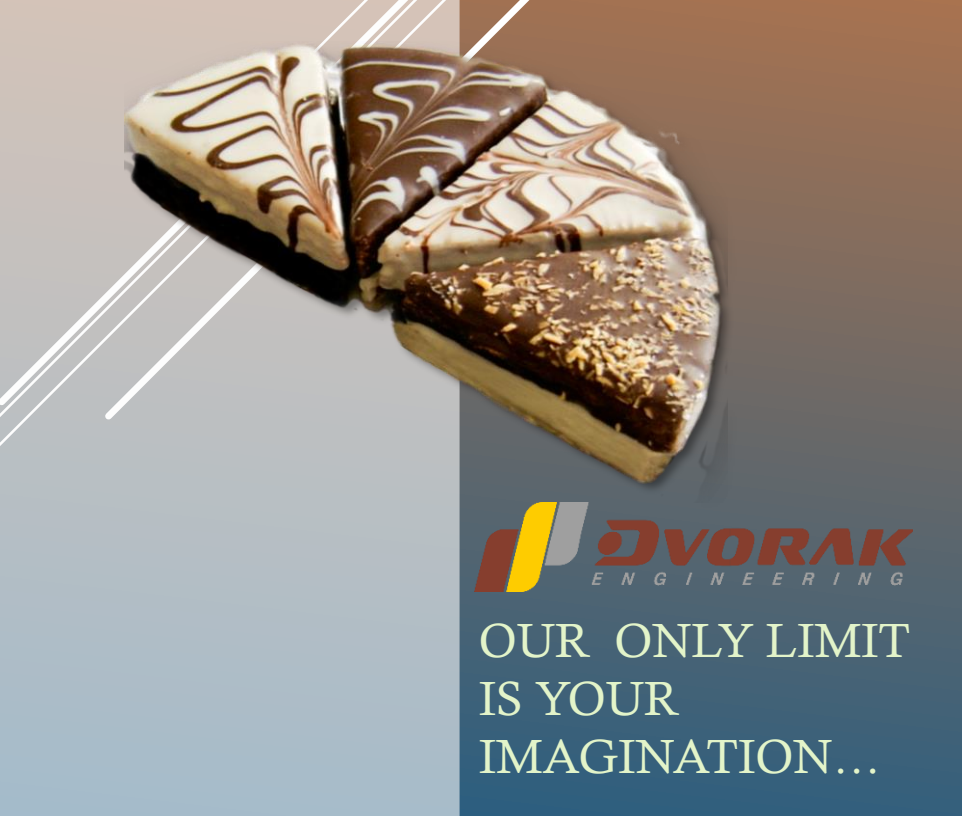
Wafer cakes production plant.